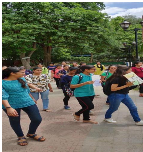
NSS Volunteers doing awareness rally at the college