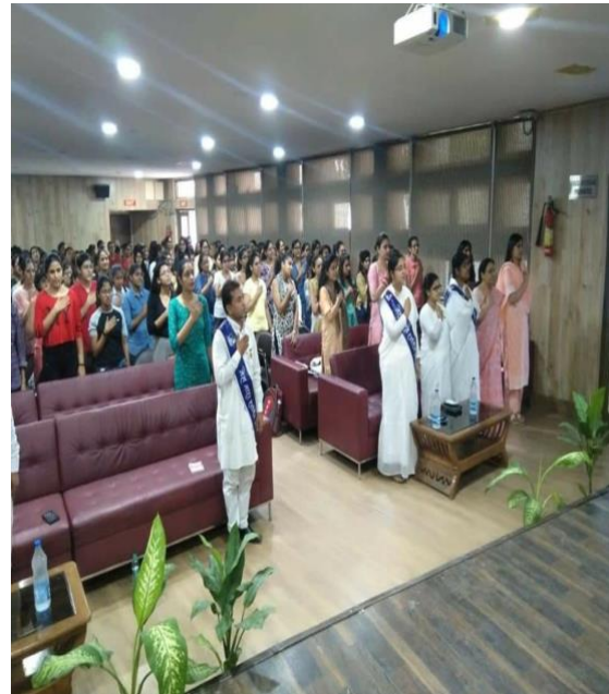
NSS Volunteers attending the event