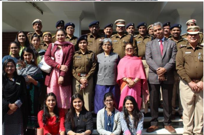
NSS Volunteers participating self-defence techniques