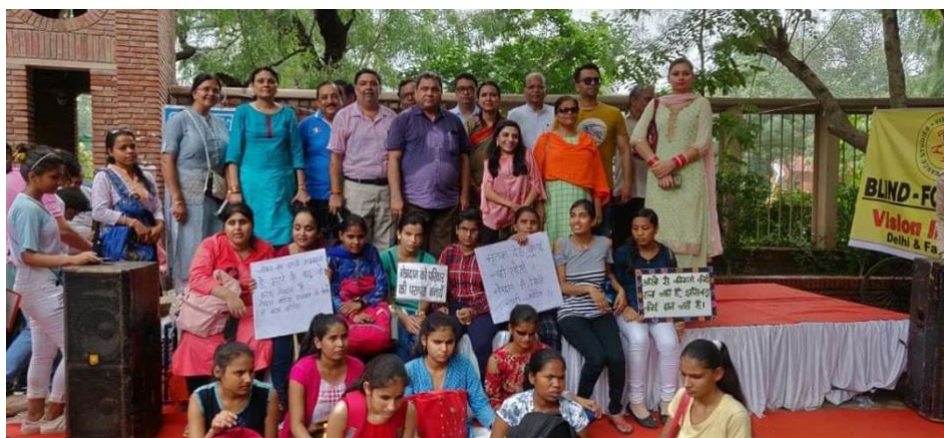
NSS volunteers along with VCS students participating in the rally