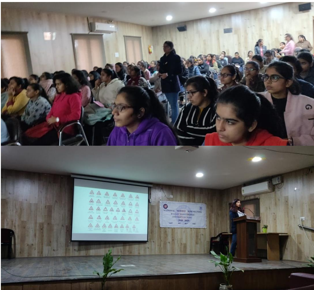
NSS Volunteers participating in the oath ceremony

Report: The NSS organised an interactive workshop on Road Safety. It was conducted by Delhi Traffic Police on 20 th January, 2020. The session was focused on safety signs and symbols and principles that need to be followed. One of which included the good Samaritan rule. Overall, it was an enlightening experience that provoked some important thoughts and conversations.