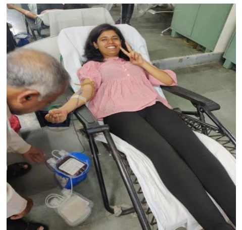
NSS Volunteers donating blood for social cause