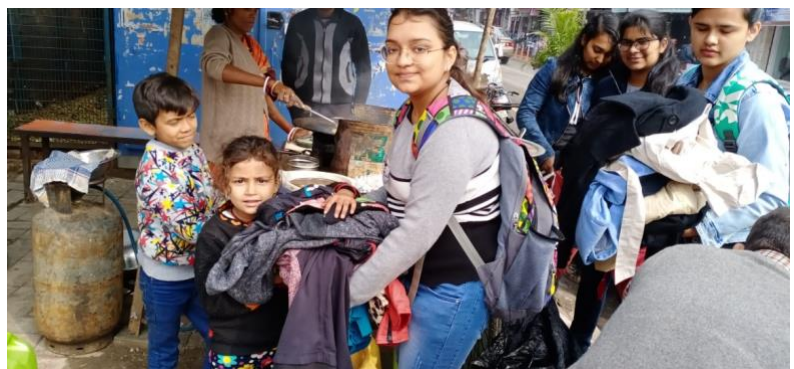
NSS Volunteers participating in the donation drive