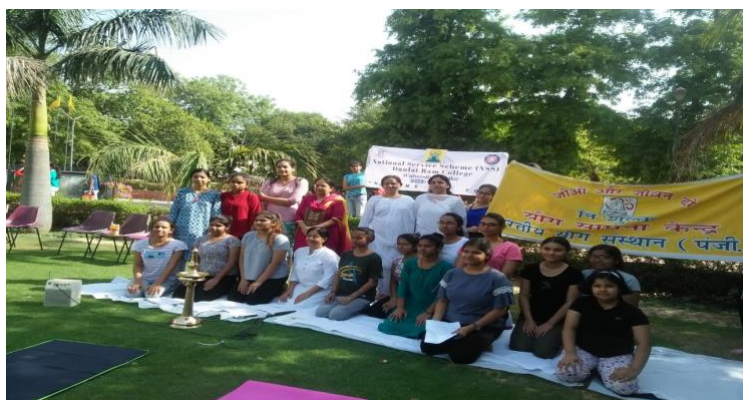
NSS Volunteers performing yoga asanas during training program