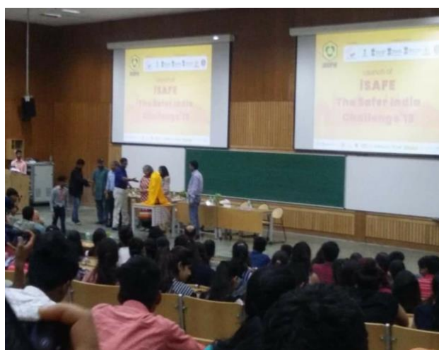
NSS Volunteers attending the event