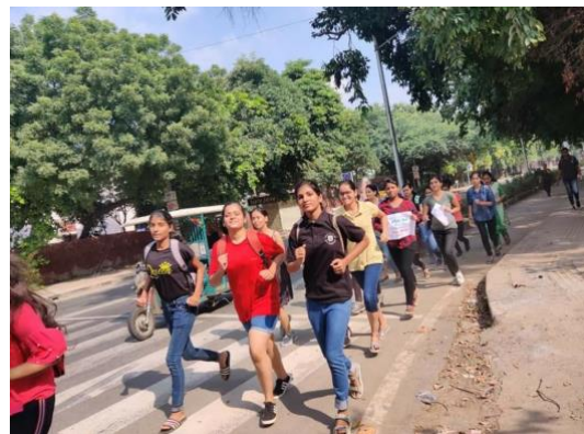
NSS Volunteers participating in the plog run