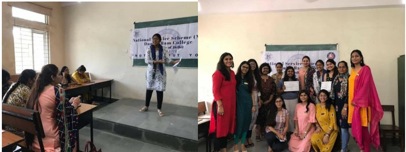
NSS Volunteers participating in the workshop

Report: A bilingual debate competition was organised by NSS unit of Daulat Ram College on 25 th September, 2019 as a part of its NSS Week celebration. The motion for the debate was- "This house believes that Gandhi's teachings are relevant to the challenges of modern India." 16 students participated and extensively reasoned the viability of Gandhi's teachings in today's India. Students speaking against the motion argued that modern challenges need new and innovative solutions. On the other hand, students speaking for the motion supported the idea that Non-violence takes time but gives guaranteed results with less damage to people and property. Overall, the house witnessed a healthy debate over the motion that provided the participants with deep insights from both the sides.