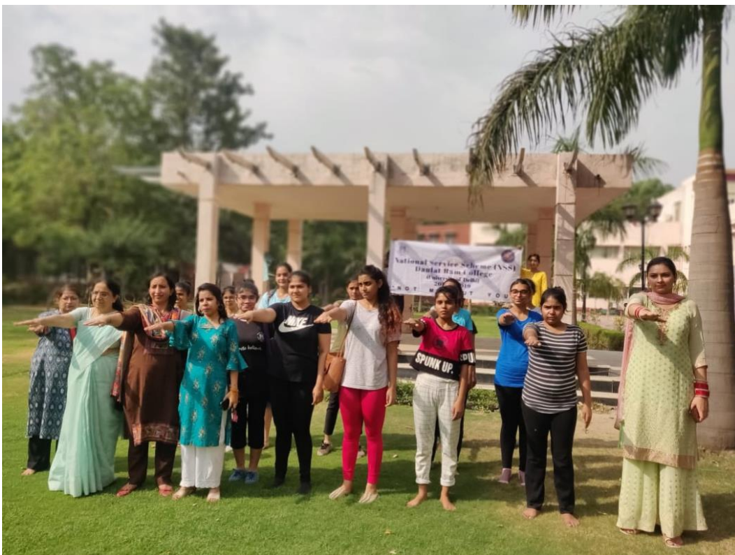
NSS Volunteers along with teachers taking oath

Report: DRC NSS Unit organised a pledge ceremony on 6 th June 2019 to observe World No Tobacco Day (WNTD). 20 students along with the NSS union members administered the pledge through which they swore to never consume tobacco products and to motivate others to do the same. World No Tobacco Day, 31 st May, is observed to draw attention to the widespread prevalence of Tobacco use and its negative health effects. The campaign also serves as a call for action, advocating for effective policies to reduce Tobacco consumption and engaging stakeholders across multiple sectors in the fight for Tobacco control.