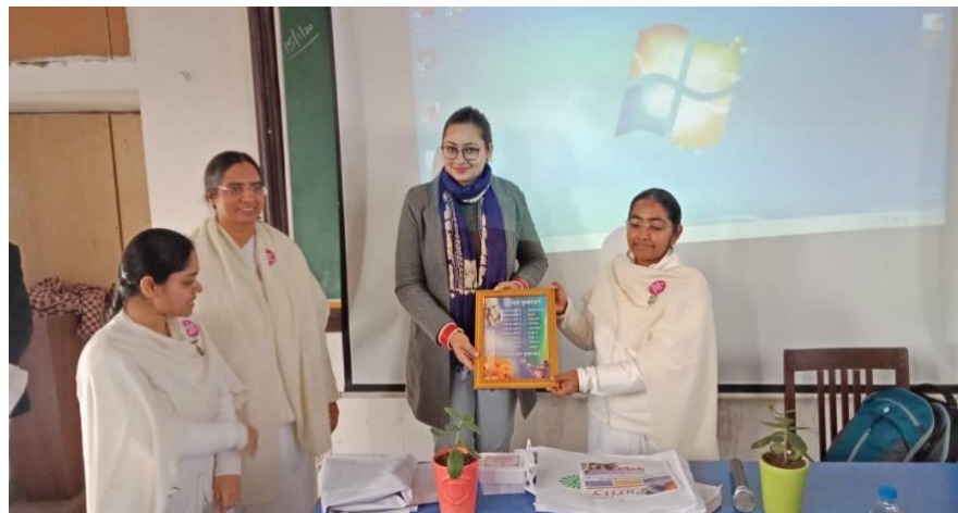
NSS Volunteers attending the event