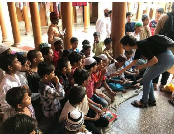
NSS Volunteers doing distribution of stationery and toiletries