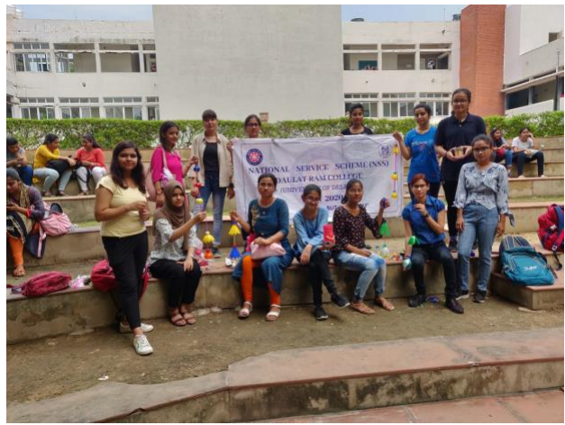
NSS Volunteers participating in the workshop