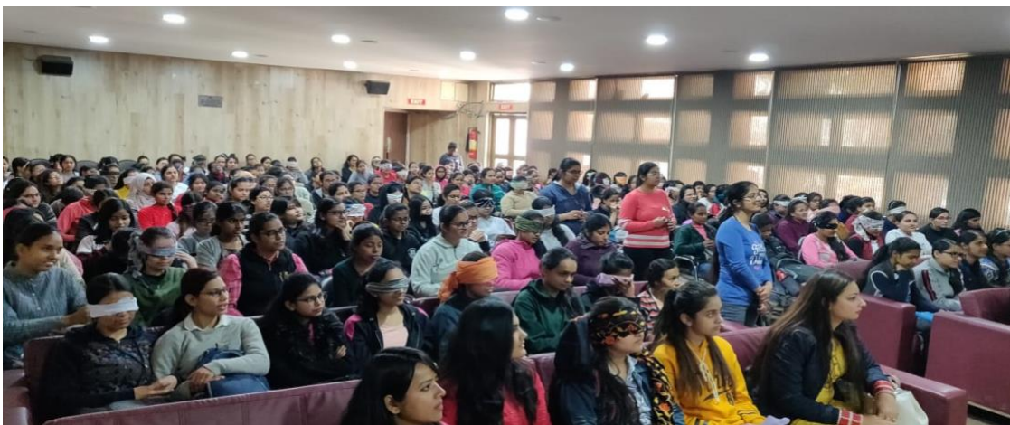
NSS Volunteers attending the event