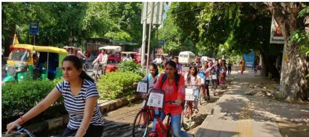
NSS Volunteers participating in the cycle rally