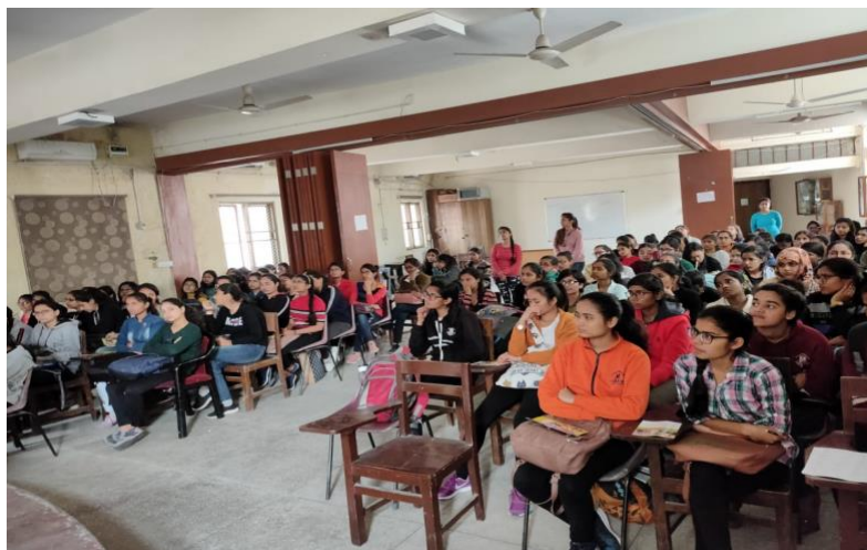
NSS Volunteers attending the event