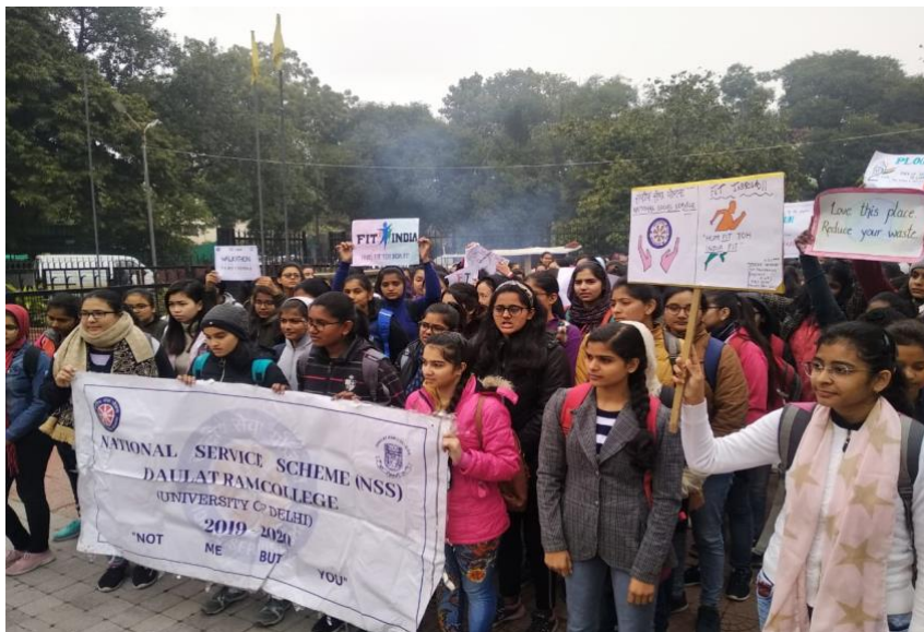
NSS Volunteers participating in walkathon

Report: “Each new day is a new opportunity to improve yourself. Take it. And make the most of it.” The NSS unit of Daulat Ram College organized a Walkathon as a part of the Fit India Initiative on 18 th January, 2020. The walkathon was conducted in the college campus in which 100 volunteers took an active part. The walkathon was conducted in order to raise awareness about the necessity to keep oneself fit and healthy. Besides, an emphasis was also laid by the volunteers on how together we can all help each other to stay fit and bring a positive change in the society.