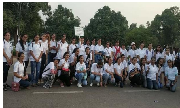
NSS Volunteers attending the event