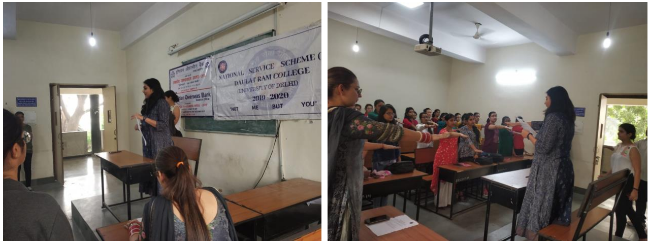
NSS Volunteers participating in the oath ceremony

Report: NSS Unit of DRC in association with Indian Overseas Bank, University Branch conducted an oath taking ceremony on the theme 'Integrity - A way of life' on 2 nd November, 2019 as a part of the 'Vigilance Awareness Week'. 30 volunteers participated in the event and vowed to neither take nor offer bribes. The students were determined to make India corruption free to facilitate the overall development of the country.