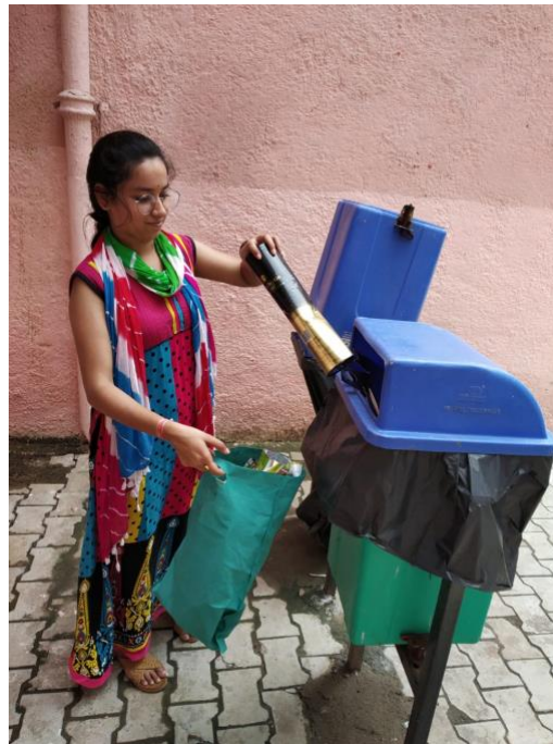
NSS Volunteers doing waste collection drive