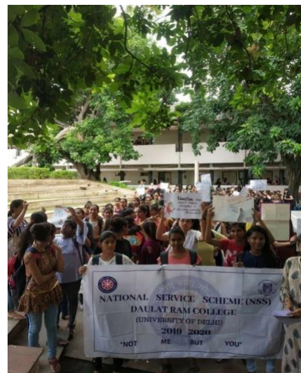
NSS Volunteers participating in the workshop