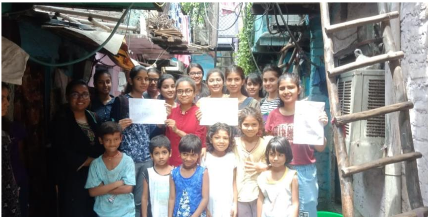
NSS Volunteers performing awareness rally at the slum area

https://drive.google.com/file/d/11eO-vKkiBwrex0jObBv5iI2VNVRekDRo/view?usp=sharing