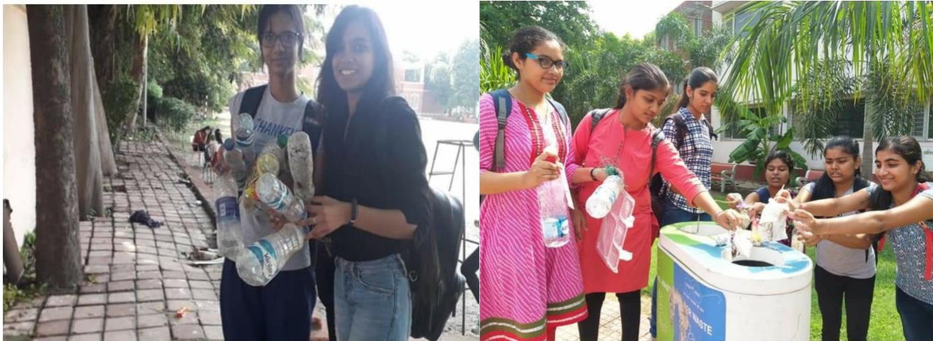
NSS Volunteers doing waste collection in the college premises

Report: As a part of the ongoing celebrations of NSS Week, NSS DRC has dedicated this week to make efforts to 'beat plastic pollution'. The unit conducted Shramdaan - plastic waste cleanliness & segregation drive around the college campus on 26 th September, 2019. A total of 25 volunteers collected the plastic waste inside the college campus, such as discarded bottles, wrappers, cups and plastic bags. The collected waste was promptly disposed of by the students in a bid to make the campus a 'plastic-litter free' zone. The students also reflected upon the need to sensitize others towards the cause and put forward suggestions for better management of plastic waste.